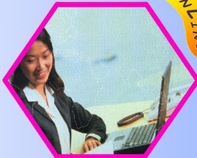
Web Based Management