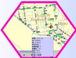
Track & Trace